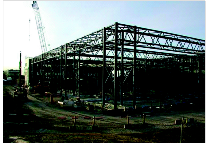
At this stage in construction, piping in the basement was already completed.

Meanwhile, the building was designed and constructed in independent sections, each planned to accom-