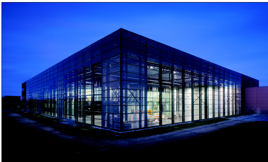
The production facility at night.