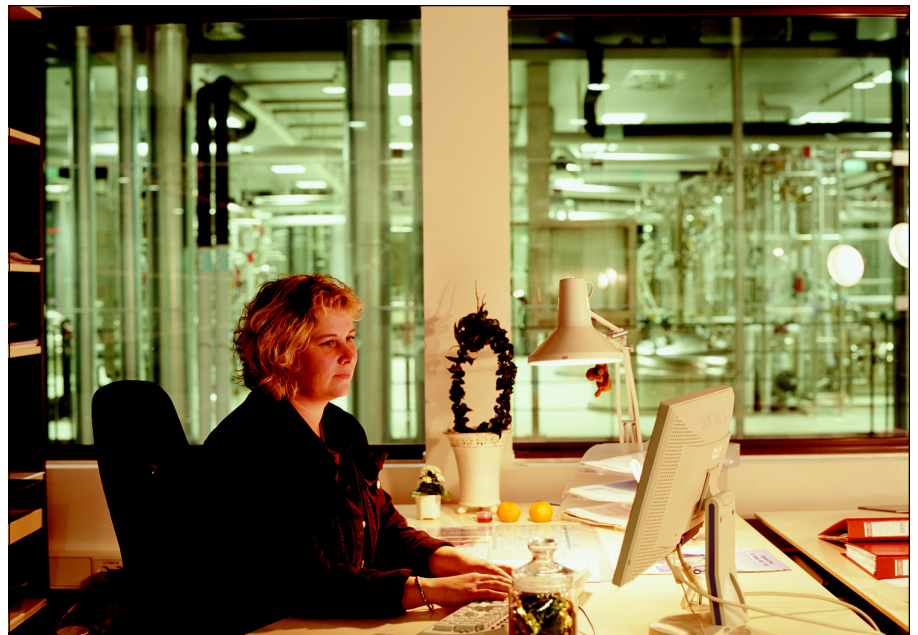
To create a feeling of unity and purpose among the employees, the offices and meeting rooms in the common building offer lots of views of the production area.

The NovoSeven facility consists of four different components, each of which has a distinct structure and specific demands for surroundings, surfaces and HVAC. The four sections include the classified production area, a utility area for supporting processes and buildings, an energy center supplying power to the entire facility, and a common administration building with offices, laboratories, and employee canteen. “We wanted each area to ‘explain itself’ through the chosen materials and finishes. Glass and steel, for instance,