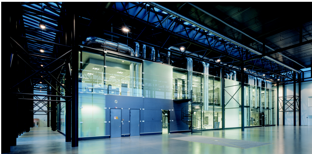
The third production area is open and ready for use if an expansion of the production capacity of NovoSeven® should be needed.

Distribution piping between modules (product, CIP/SIP, solvents and utilities, collection of waste, etc.) was a critical path issue for the modular design since it had to be installed and ready to connect as each module arrived onsite. Piping installation could not impede module delivery, and it needed to allow for adjustment in the event of