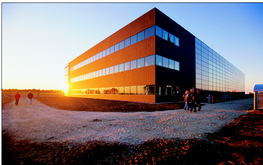
The working environment is bright and open with many varied views to the outside from different places within the facility.

eted new distinction: 2005 Facility of the Year. The NovoSeven facility was chosen from an outstanding field of 28 global entries, each with powerful merits and award-winning attributes in its own right. Novo Nordisk was presented the Facility of the Year Award during the Plenary Session of the 2005 INTERPHEX exhibition, held in New York in April.